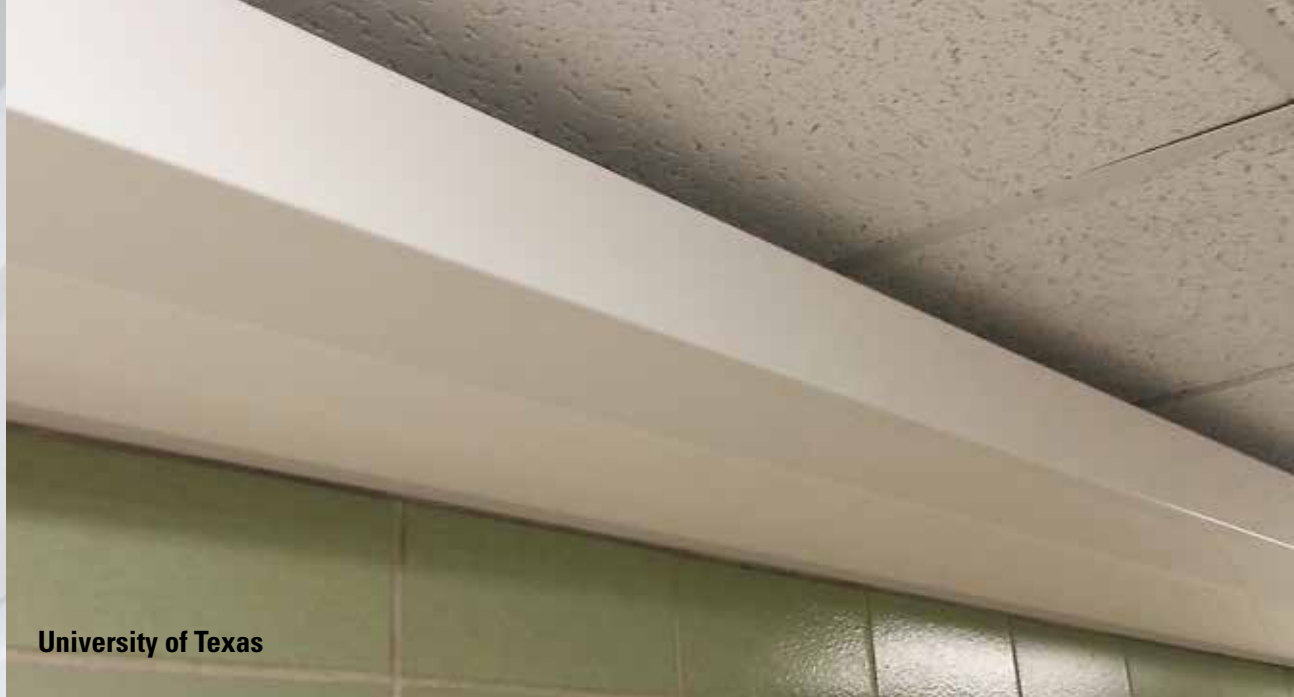
University of Texas