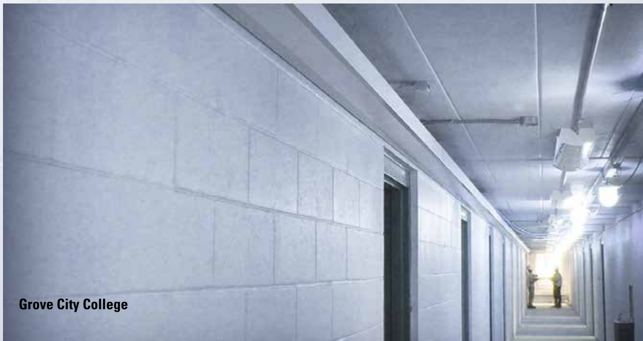
Grove City College