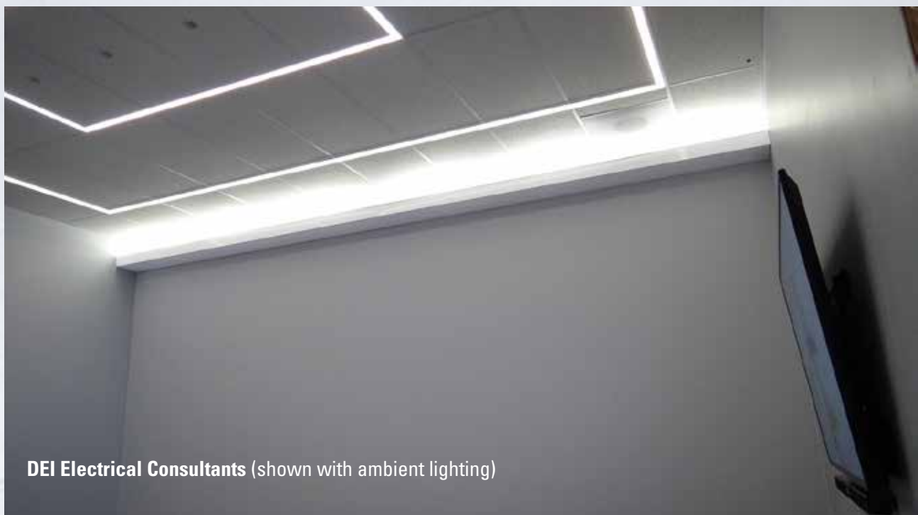
DEI Electrical Consultants (shown with ambient lighting)